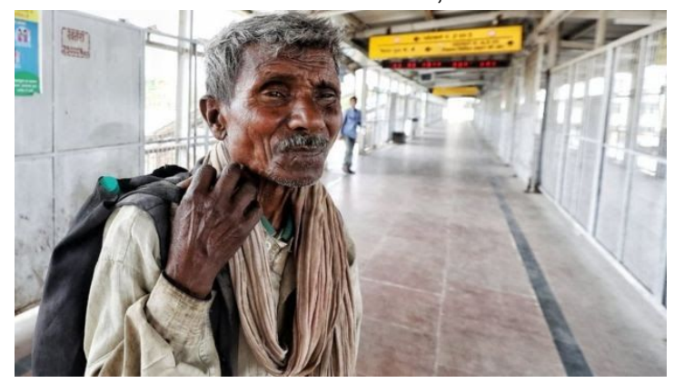
This cobbler - who did not give his name - did not know why the station was empty

"All governments need to act lightning fast because the situation is changing every day. We need to activate big community kitchens and deliver food to people who need it. We need to hand out cash or rice and wheat - irrespective of who comes from which state," he said.